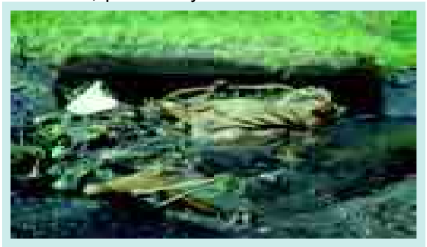
Storm drain with debris from a recent rain storm.

the Center for Watershed Protection has developed a general watershed planning model, known as the impervious cover model (ICM), which predicts that most indicators of stream quality decline when watershed impervious cover exceeds ten percent, with severe degradation expected beyond 25 percent. The ICM has proven to be an extremely important tool for watershed planning, since it can rapidly project how streams will change in response to future land use, particularly for small