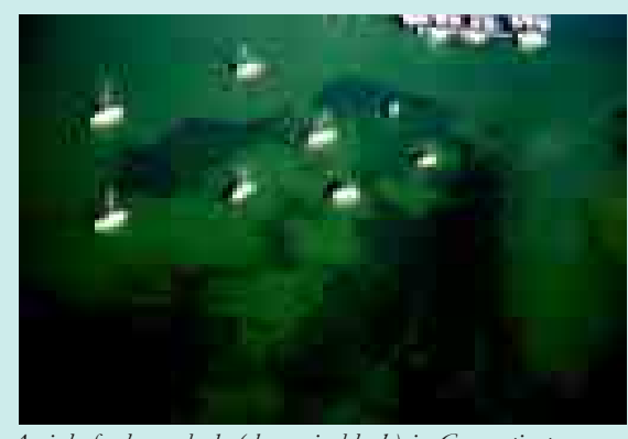
Aerial of eelgrass beds (shown in black) in Connecticut.

These data will be compared and contrasted to the survey of Dr. Yarish to identify trends in eelgrass abundance. It will take a series of aerial surveys to have sufficient data to reliably