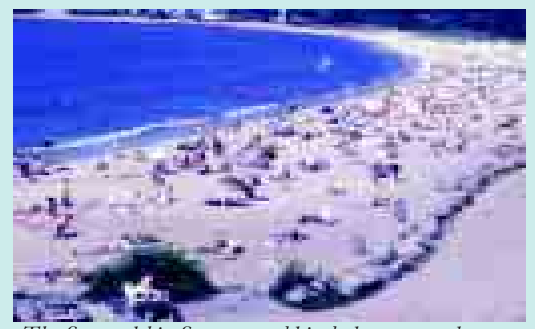
The Stewardship System would include access and recreation sites.

uplands around the Sound. As stated in the Listen to the Sound 2000 report, "What's at stake is the very soul of the Sound and its waterfront communities, and the integrity of the Sound's ecological systems... Approximately 10% of its shoreline