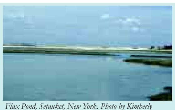
Flax Pond, Setauket, New York.

A popular issue for Long Island Sound these days is the creation of a system of reserves. In conservation biology, the term reserve relates to an area in which natural ecosystems are protected from most forms of human use (Hunter 1995). Webster's New World Dictionary defines reserve as "something kept back or stored up, as for later use or for a special purpose". In the context of Long Island Sound, the challenge of establishing a reserve system means conserving key resources while serving the lifestyles of the more than 20 million people