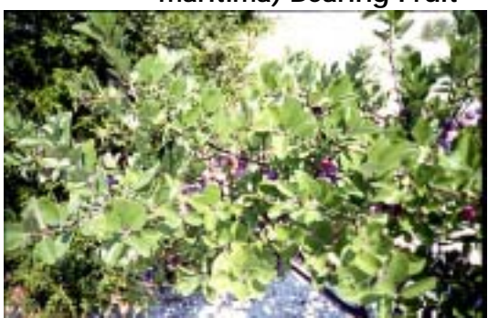
Figure 5-2. Beach Plum (Prunus maritima) Bearing Fruit

as more stable substrate. Herbaceous species include beach heather ( Hudsonia tomentosa ), seaside goldenrod, bearberry ( Arctostaphylos uva-ursi ), Cyperus ( Cyperus polystachyos var. macrostachyus ), beach pinweed ( Lechea maritima ), poison ivy ( Toxicodendron radicans ), and joint weed ( Polygonella articulata ). Typical shrub species landward of the primary dunes include beach plum ( Prunus maritima ) (Figure 5-2) and bayberry ( Myrica pensylvanica ). Species diversity in dune plant communities generally increases as protection from salt spray increases. In Connecticut there is an unusual colony of beach plum known as Graves' beach plum, growing entirely as vegetative