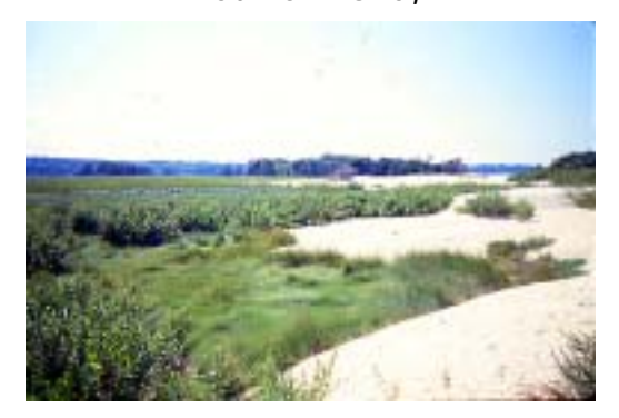
Figure 5-3. The Back Shore of the Barrier Beach at Flax Pond, NY

The upper limit of the backshore beach may also include perennial herbs dominated by seabeach sandwort and interspersed with sea rocket and beachgrass. This community assemblage is rare in Connecticut. This habitat is used for breeding by the northern diamondback terrapin ( Malaclemys terrapin ).