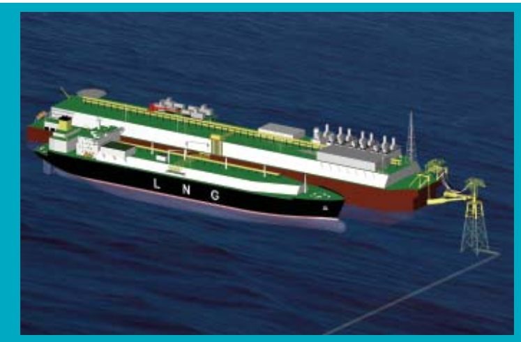
LNG carriers would dock at the proposed Floating Storage and Regasification Unit (FSRU) and offload the LNG as depicted in this artist's redering.

Faced with the daunting task of locating an import terminal in a post 9/11 world, Broadwater and other energy companies are looking offshore to defuse safety concerns. Offshore siting has the added advantage of avoiding population centers, eliminating landbased environmental concerns and those associated with dredging port channels to accommodate deep-hulled LNG tankers. Broadwater proposes to place its terminal in the deep-water center of the Sound. The location, certainly not by coincidence, is in New York waters. It would also allow the terminal to connect, after burying 25 miles of new pipeline beneath the Sound's seabed, to the existing Iroquois gas pipeline that supplies natural gas to the region.