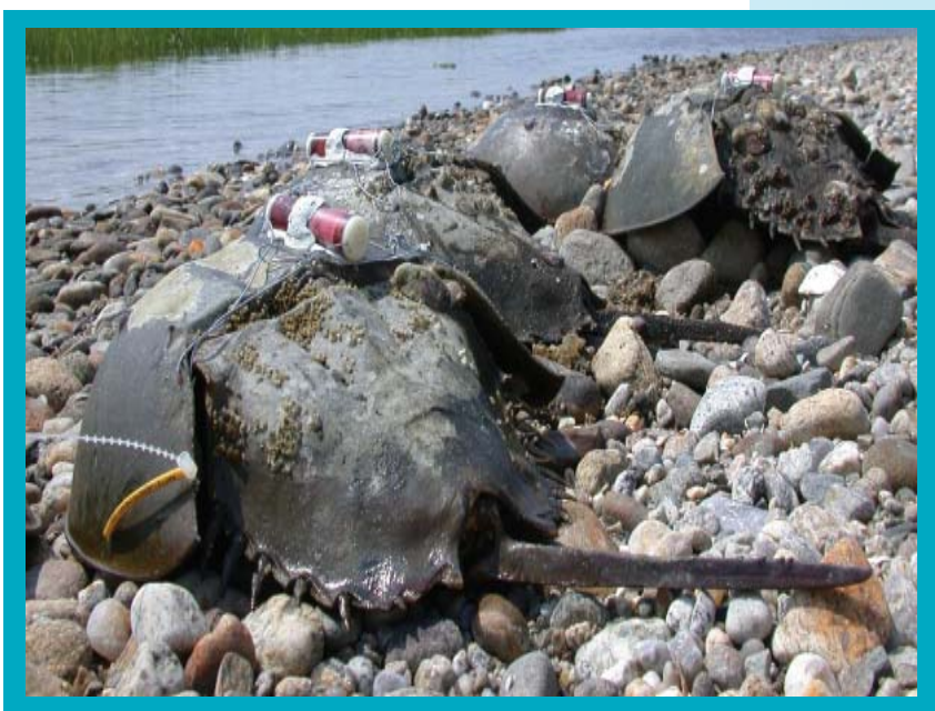
An example of what a tagged horseshoe crab looks like with the yellow cincletag on the side and the sonar tag on top.