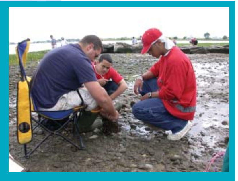
Harding High School cinch tagging and measuring horseshoe crabs at Milford Pt.,

Limulus has a unique ecological role in Long