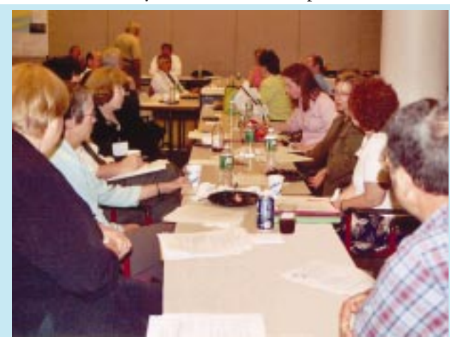
CAC meeting June, 2003 at Pfizer in NYC.

1986, Save the Sound, Inc. (formerly the Long Island Sound Taskforce) held a meeting with the Chesapeake Bay Program to discuss effective public participation techniques. This meeting brought attention to the idea of forming a CAC. Representatives from five organizations formed a steering committee and defined the CAC's composition and role. At this same time the EPA created a new Management Committee to direct the Study. The CAC developed a