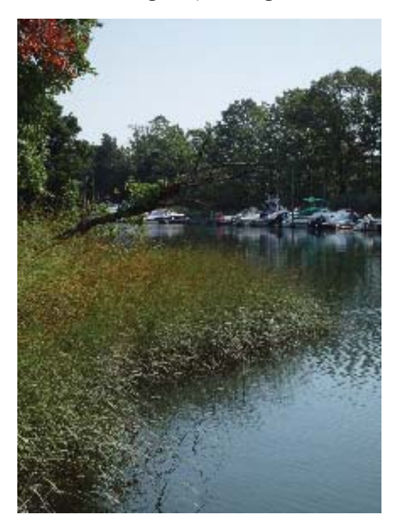
Nissequogue River, NY

To bring attention to these needs, Audubon, the Regional Plan Association (RPA), and Save the Sound (STS) organized the Listen to the Sound 2000 Campaign. The Campaign was an initiative to gain citizen input on strategies to advance the ecological resource and land-use goals outlined in the CCMP. There was strong public sentiment regarding the urgent need to focus on restoring and protecting the Sound's