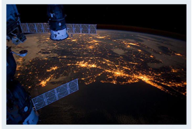
Long Island Sound can be seen in the right corner from this photo taken by the International Space Station on Feb. 6, 2012.