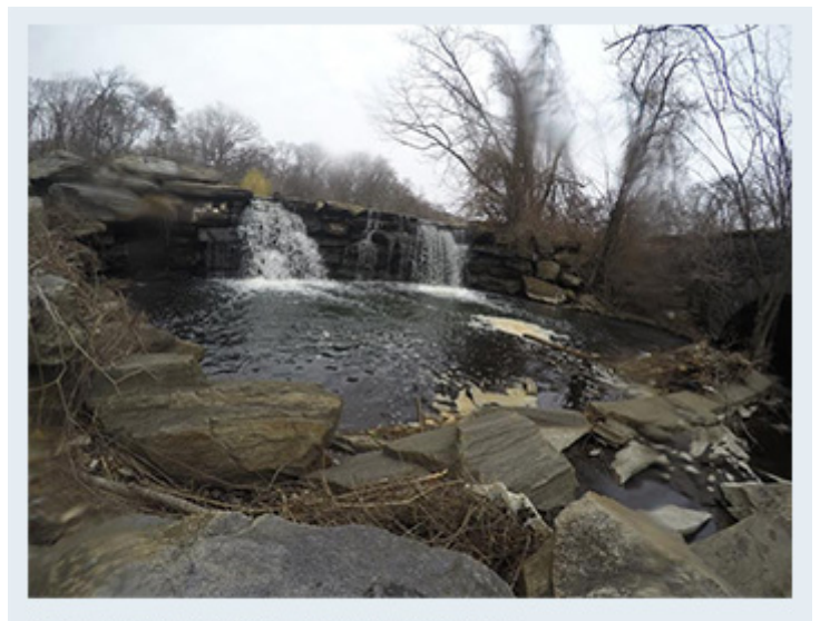
The Pelham Lake Dam in Mount Vernon, NY.

Fishway projects have helped open up hundreds of river miles for migratory fish to swim from Long Island Sound into streams in Connecticut, Long Island, and the Bronx. Now a location in Westchester near the Bronx border is being studied for the County's first Long Island Sound site. While resource managers believe that it is highly likely that a fishway on the river would encourage migratory fish to swim upstream based on the outcomes of similar projects close by in Connecticut and the Bronx, monitoring this spring has provided an important signal to continue proceed: the first known recording of alewife at Pelham Lake since dams along the Hutchinson River were built in the 19th century. Read about it in Sound Spotlight.