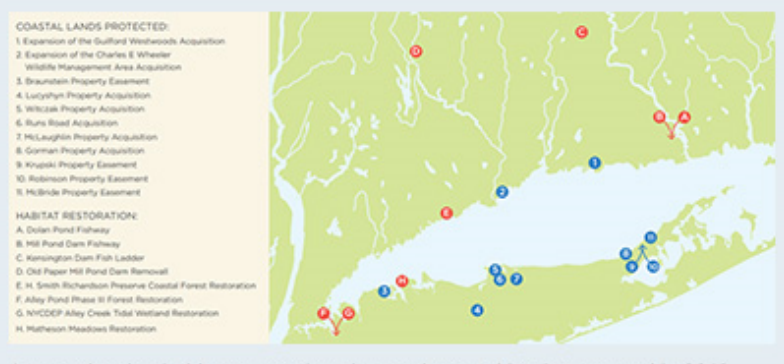
A map showing habitat restoration sites and coastal lands protected in 2019 from the Year in Review report. Map by Lucy Reading-Ikkanda.

An aerial view of the Lower Connecticut River.